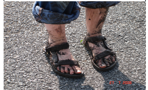
The answer will be put out in tomorrows Daily Dragon.

Guess the feet!! Can you guess who's feet these are? Really muddy aren't they!